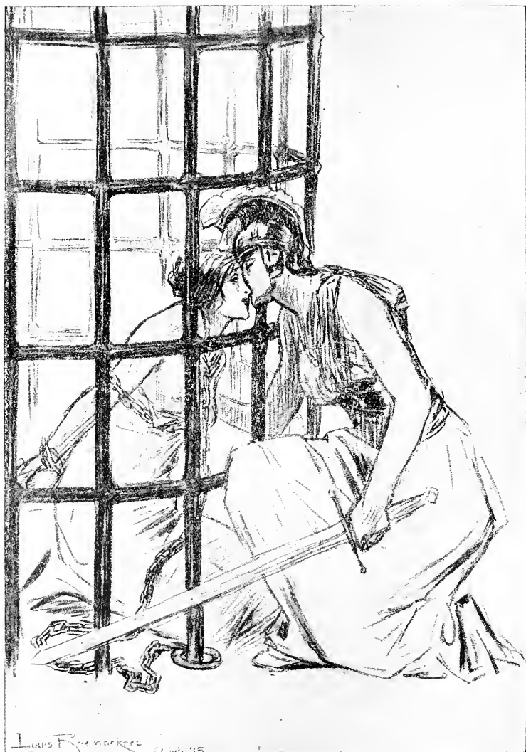
Through the Iron Bars.